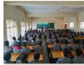
Madhu Siddaganga Poleytecnic College Tumkur.jpg