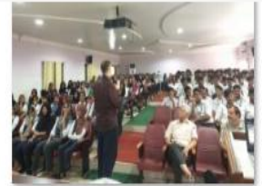
Illahia eng Abi compressed.jpg