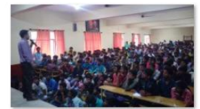
Sunil Siddaganga Pu College Tumkur.jpg