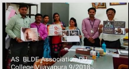
AS BLDE Association PU College Vijayapura 9/2018