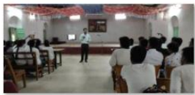
Sunil Bishop Sartag Pu College Tumkur.jpg