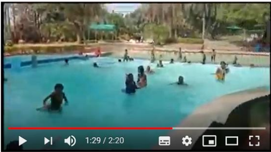
Christmas with Orphans 2019