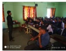
Sunil Government Degree College For Girls Hunsuru.jpg