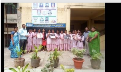
Secab PU College for women