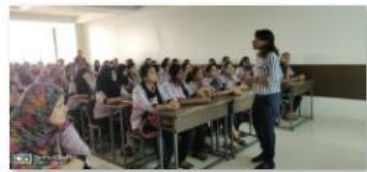
Bunts sangha Liny.jpg