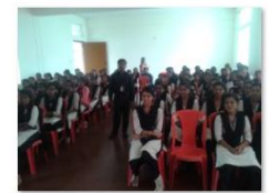
Madhu St Joseph Degree College Hunasuru.jpg