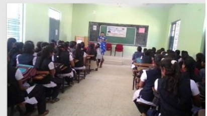
12 Govt degree college Bilikere - Shruti