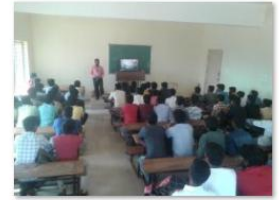
Madhu Government Degree College Nanjanagudu.jpg