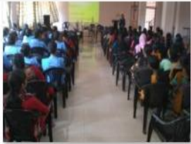
Govt Nursing college Kalamassery.jpg