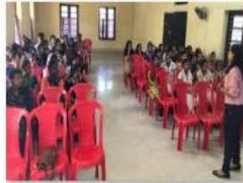
Govt Nursing school ERN .jpg