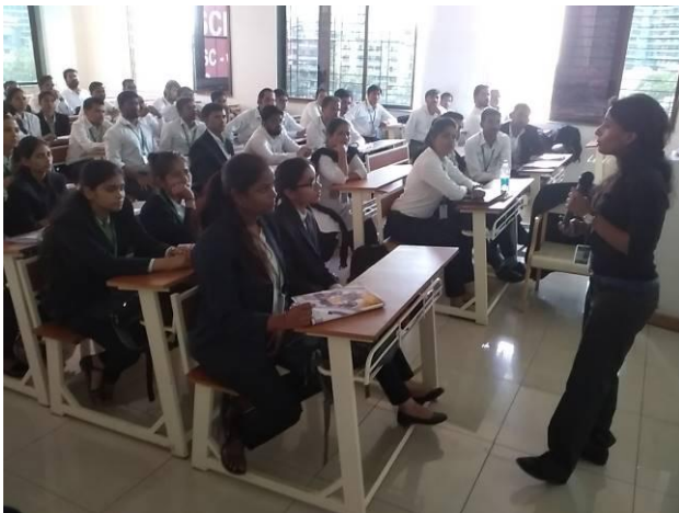
Liny KLE Law college Mumbai Why Youth Abortions Harmful 90% of students changed their minds