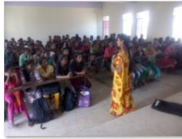
Arpitha Government Poyetecnic COLlege Chamarajanagara.jpg