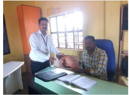
Sunil Citizen Pu College Nanjangodu Poster.jpg