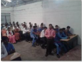
Madhu Sathya Sai ITI College Hunasuru.jpg