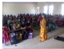
Arpitha Government Poleytechnic COLlege Chamarajanagara.jpg