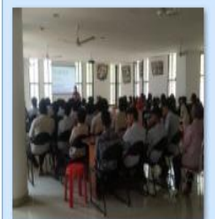
St. Paul's degree Liny.jpg