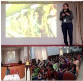
Lissie nursing Liny.jpg