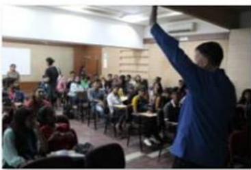
Bants Sangar Media Journalism.jpg