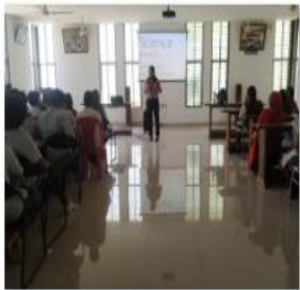
St. Paul's Liny.jpg