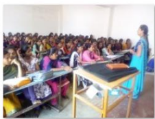
Arpitha Adichunchanagiri Degree College.jpg

Full college and program details, phone numbers and principals signs: www.rescue108.com/records108