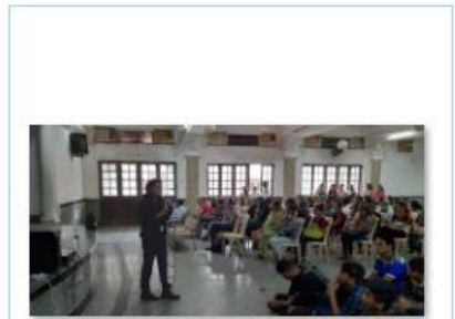
Versova Welfare Jr Liny.jpg