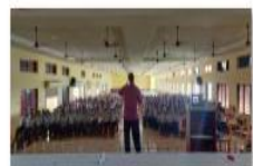
KMEA engineering Abi.jpg