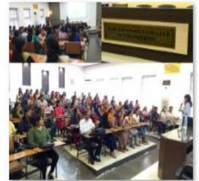
MA eng college Liny.jpg