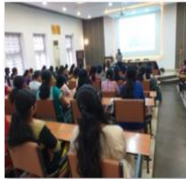
M.A college Liny.jpg