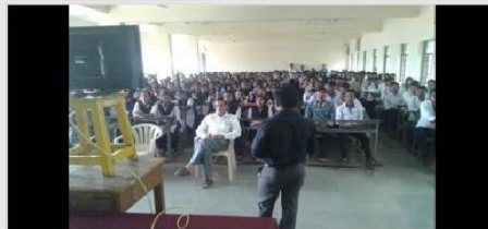
Basaveshwara degree college -Madhu