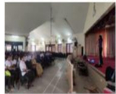
Albertians eng Liny.jpg