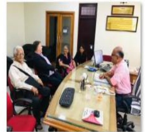
vishwaiyothi college princi cabin.jpg