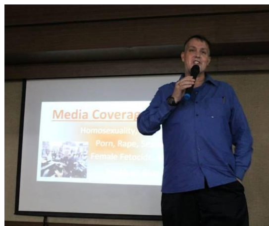
LEFT: Jai Hind Optional Program: Ruining of Romance and Poison of Pornography: 600 students packed into the auditorium, RIGHT: Abishek Teaches Journalism Students