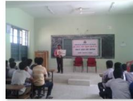
Madhu GOvernment Degree College Bilkere.jpg