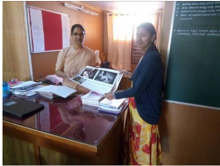
Arpitha Carmel Pu College Nanjangodu Poster.jpg