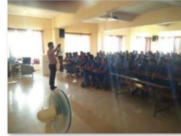
Sunil Government ITI College Pandavapura.jpg