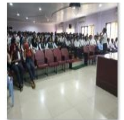
Illahia engineering Linycompress.jpg