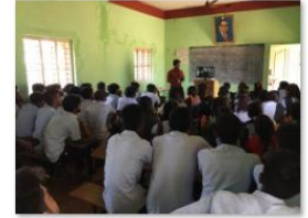
Sunil Siddartha Degree College Chamarajanagara.jpg

Most students have never heard a seminar on why pornography will ruin their marriage, studies, concentration on work, psychology and society. We give 10 reasons why they should stop watching porn. 91% of boys after the program report that they will put porn blocking software on their mobiles. So that we can reduce sexual harassment and rape epidemic in India we have to address the root of the exponential increase in these issues: violent pornography. We warn the students in these seminars that violent pornography may inspire: violent sexual assault, turn them into a rapist over time, desensitization of the horror of rape, violent behaviour in the marital act and the viewing of progressively more aggressive and dangerous forms of pornography that will warp their natural minds.