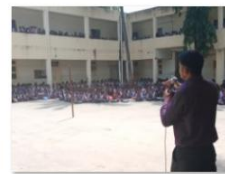
Sunil Government Girls Pu College Nanjanagudu.jpg