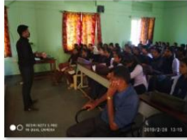
Sunil Government Degree College For Girls Hunsur.jpg