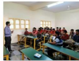
Sunil Kempegowda Pu College Tumkur.jpg