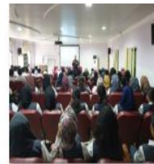
illahia engineering Abicompress.jpg