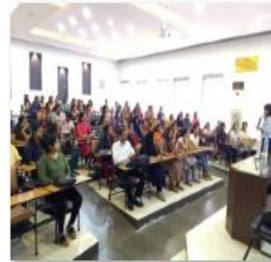
MA college Liny.jpg