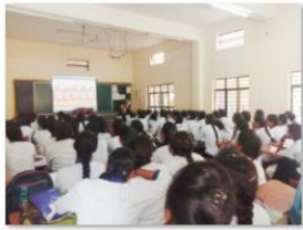
Arpitha Vidyaavahini Pu College Tumkur.jpg