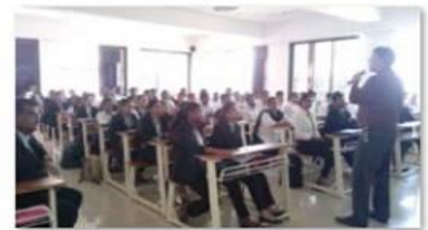
kle LAW 90pc HOMO CHANGE 2.jpg